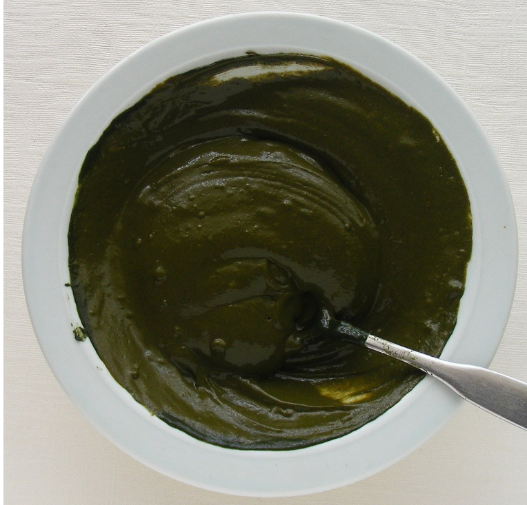
Henna and indigo mixed completely, ready to use. 2

The dye molecules in indigo will change from the indoxyl state to the blue indigo state after about twenty minutes of exposure to air and acidic henna, and the longer the paste sits, the less effective it will be as a brunette hair dye. If you let your henna and indigo mix sit out too long, the henna red will prevail over the indigo tones. Keep your henna in one bowl and in a second bowl mix a small amount of indigo into henna and use that quickly. If you mix up the whole batch together at once you'll lose some of the indoxyls before you get all of the mix applied, and the results may be redder than you wished. Mix as much henna and indigo together as you can use in about twenty minutes. If you leave a henna-indigo mix in your hair overnight, you may find that more lawsones have migrated into your hair, and fewer indoxyls, because the indoxyls were lost to air and acidity, while the lawsones kept going strong.