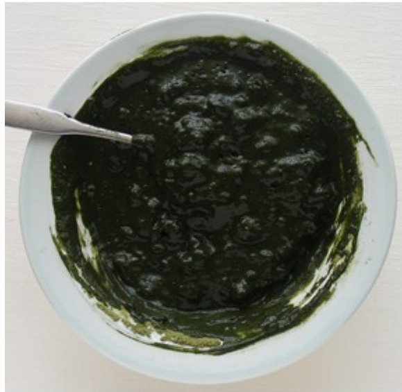
Ancient Sunrise® indigo mixed with water

Add distilled or filtered water gradually to Ancient Sunrise® indigo powder stirring after every addition. Do not add an acidic liquid!