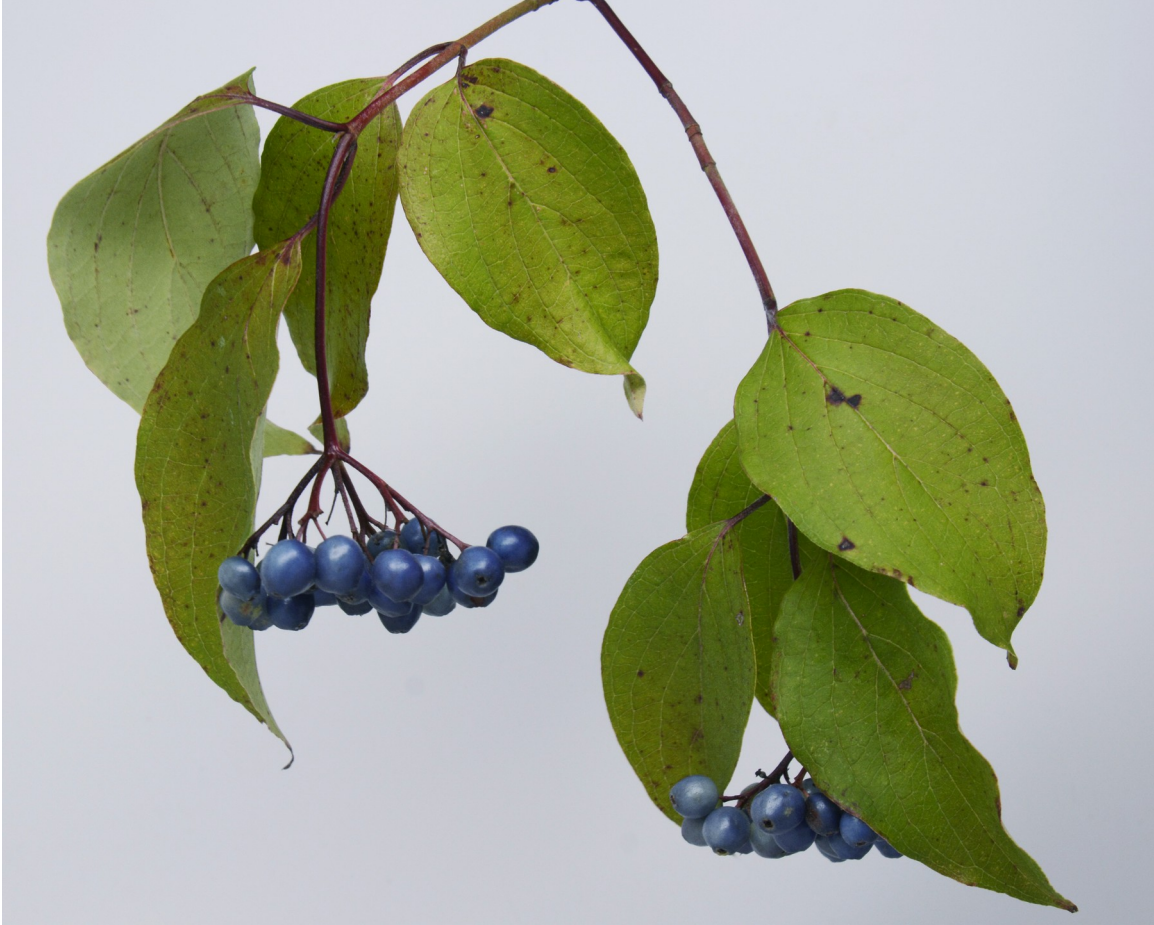
Ancient Sunrise® Nightfall Rose: Aronia Prunifolia

Ancient Sunrise® Nightfall Rose is a mildly acidic wild fruit powder with a high level of anthocyanin, a pigment produced naturally in the berries. Anthocyanin pigments range from blue to purple to pink. Anthocyanins create the colors in ripe blueberries, blackberries, grapes, elderberries, cranberries, raspberries, cherries, pomegranates, and plums, eggplants, beetroots, and red cabbage, the fruits and vegetables that are beneficial in our diets. 8 Anthocyanin pigments can give rise to an array of red to blue colors, depending on the pH of the medium. 9