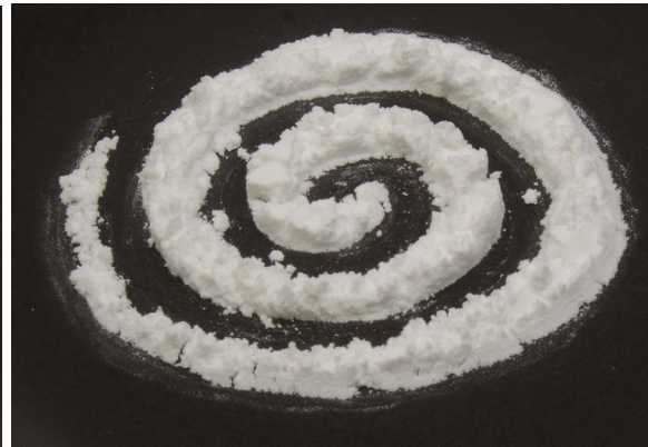
Ancient Sunrise® Malluma Kristalovino Potassium bitartrate

Of all the mildly acidic liquids that may be used to mix henna, diprotic acid and potassium bitartrate are the most gentle and least likely to cause skin irritation or dryness in hair. Mix one teaspoonful (4g) Ancient Sunrise® Kristalovino into filtered or distilled water per 100g of