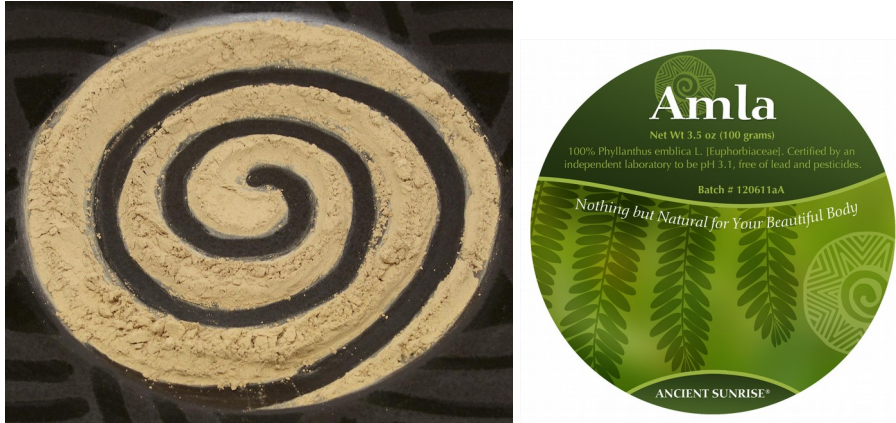
Ancient Sunrise® Amla

Amla, emblica officinalis , is a wild gooseberry that grows in South Asia. Ancient Sunrise® Amla powder is typically about 3.5 pH, and naturally contains gallic acid, ellagic acid, and ascorbic acid. 7 Gallic acid is commonly found in tree barks, ellagic acid is commonly found in berries, and ascorbic acid is a form of vitamin C. Add 25g of Ancient Sunrise® Amla to 100g of henna or cassia and enough filtered or distilled water to make a paste. No further acid will be needed. The gallic acid in amla lends ash tones to henna/indigo mixes. Amla's acids temporarily snap the hydrogen bonds in keratin, and allow greater uptake of indigo, and make henna/indigo mixes considerably darker and more ash colored.