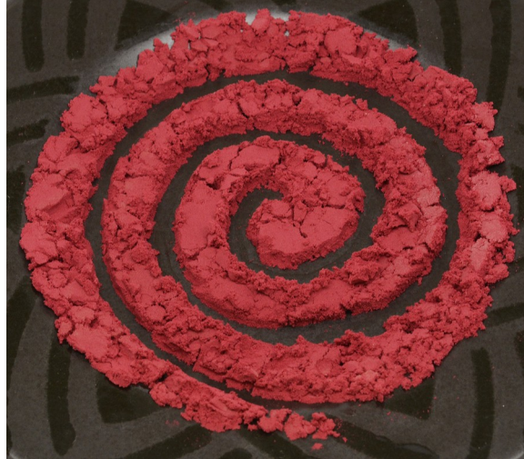
Ancient Sunrise® Nightfall Rose powder

Ancient Sunrise® Nightfall Rose naturally has malic acid and is acidic enough to make a hydrogen rich henna or cassia paste. Add 25g of Nightfall Rose to filtered or distilled water or the tea of your choice, and stir that into 100g of henna or cassia powder; increase the amount of Nightfall Rose as you increase the amount of henna or cassia.