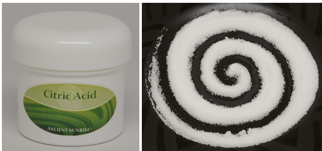
Ancient Sunrise® Citric Acid

Ancient Sunrise® Citric Acid is convenient for mixing a mildly acidic henna paste. You can add powdered citric acid to your favorite tea, filtered, or distilled water. Add 6g or 1 teaspoon per 100g of henna, or enough citric acid to the tea or water to make it taste as tart as lemonade. Citric acid mixture stains do not darken as much as citrus juice mixtures. Citric acid paste mixtures tend to create bright coppery stains that stay light and bright.