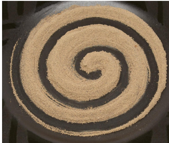
Ancient Sunrise® Copperberry powder

Ancient Sunrise® Copperberry can be used to mix a hydrogen-rich henna paste. Copperberry has high levels of antioxidants and vitamin C, higher than other fruits. 10 Antioxidants in your henna mix will keep the henna color brighter, and less likely to darken over time. You may mix Ancient Sunrise® Copperberry with filtered or distilled water or your favorite tea to make your henna paste, just as you would use Amla. Amla's gallic acid adds an ash tone to henna; Copperberry's ascorbic acid keeps the henna bright and rosy.