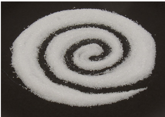
Ancient Sunrise® Kristalovino Diprotic acid

Diprotic acid, Ancient Sunrise® Kristalovino, occurs naturally in grapes, bananas and tamarind, and is used in many recipes as leavening, and in whipping egg whites in meringue. Both diprotic acid, and potassium bitartrate, Ancient Sunrise® Malluma Kristalovino, 11 are byproducts of wine. Potassium bitartrate often appears as the little red crystals at the bottom of a wine glass. The difference between the two is that potassium bitartrate is partially neutralized with potassium.