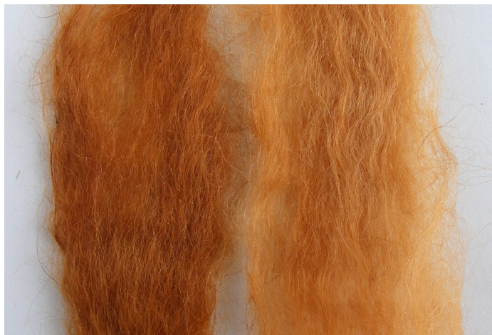
Henna and an acidic mix versus henna mixed with water

Henna was mixed with lemon juice with lemon juice and applied to the hair at the left, seen above. Henna was mixed with boiling water and applied to the swatch on the right. When the henna was rinsed out, the swatch with the lemon mix was a paler orange, and the swatch mixed with water was a brighter orange. Over several months, the mildly acidic stain shown at left gradually darkened while the water stain gradually faded.