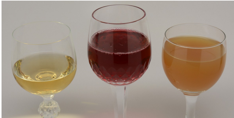
Vinegar, cranberry juice, apple juice

You probably have some vinegar in your kitchen. Vinegar is pH 2.4 and contains acetic acid. Vinegar is cheap and plentiful. The stains from henna mixed with vinegar tend slightly to a brownish tone when they mature. The only problem with using vinegar to mix henna paste is that the smell of vinegar can be very unpleasant. 12