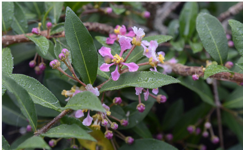
Ancient Sunrise® Copperberry: Malpighia Glabra L

The malic acid in Nightfall Rose is very gentle to hair. Though Nightfall Rose is a deep rose color, it will not add a dark red color to cassia or henna. The anthocyanins in Nightfall Rose will add a subtle ash tone to henna and cassia mixes, and creates lovely brunettes with henna and indigo mixes. The antioxidants in Nightfall Rose deter browning that may occur over time with henna.