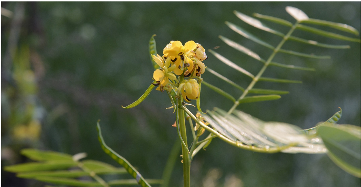
Cassia obovata flowers with seed pods beginning to form.

If the water you use to wash your hair is full of dissolved minerals, the minerals can accumulate in your hair. Some of those minerals may react with the cassia and turn your hair green, dark brown, or greenish black. Please test cassia on some hair harvested from your hairbrush! If the color looks strange, treat your hair with Ancient Sunrise® Rainwash from mehandi.com to remove the minerals before you dye your hair with cassia.