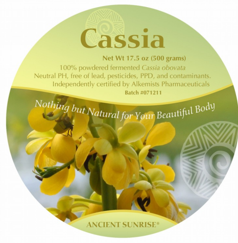
Ancient Sunrise® Cassia obovata powder.

The tannins in cassia obovata can restore a soft texture to hair that has been damaged from bleach. Ancient Sunrise® has no metallic salts, chemical dyes or adulterants; it does not react adversely with other chemical hair products.