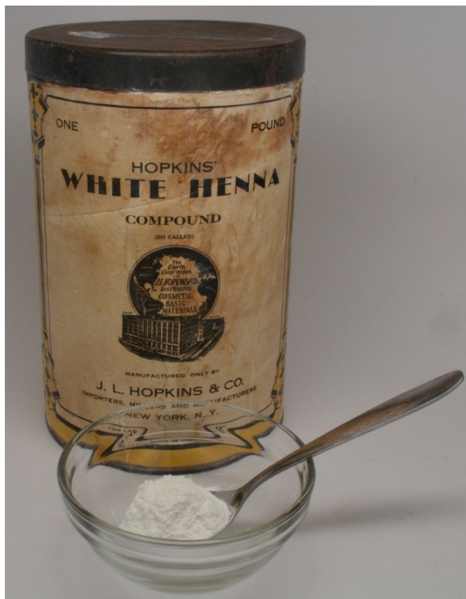
One Pound Hopkins' White Henna Compound (so called)

In the early twentieth century the term “henna” was applied to many hair dyes, whether or not the dye was actually henna; the word henna conveyed “safe” and “effective” during a time when early chemical hair dyes were haphazard and often dangerous.