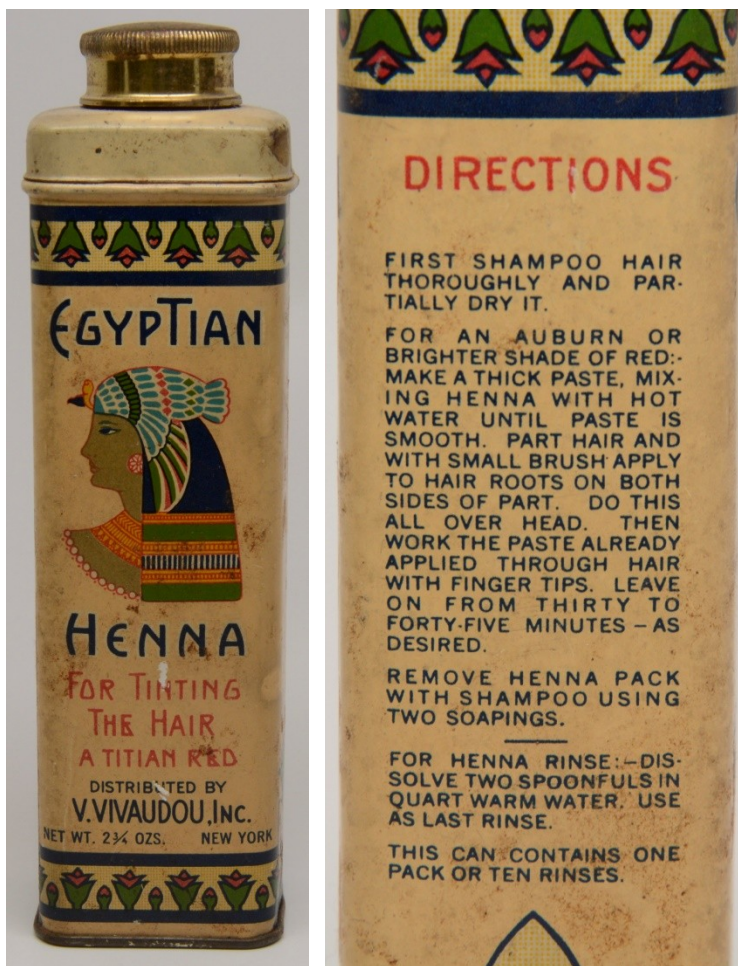
Left: Egyptian Henna For Tinting The Hair A Titian Red, V. Vivaudou. Inc. 2 ¾ oz. New York, approximately 1930, author’s collection