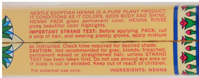
Nestle® Egyptian Henna package, ingredient declaration and USFDA compliant warning, 1970s 22