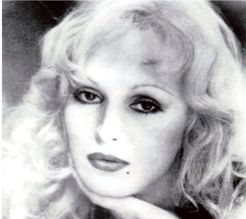
Candy Darling, (born James L. Slattery, November 24, 1944 – March 21, 1974) Protégé of Andy Warhol

The 'white henna' process did not disappear after Jean Harlow, though many other actresses bleached their hair nearly white without an added mineral pack. 'Candy Darling', a protégé of Andy Warhol, memorialized in Lou Reed's "Walk on the Wild Side," 10 repeated the technique in 11 the late 1960's.