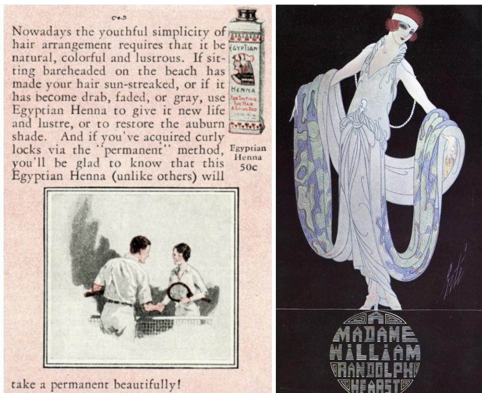
Left: Magazine advertisement for Egyptian Henna, V. Vivaudou, early 1920s 16 Right: Madame William Randolph Hearst (Marion Davies) by Erté early 1920s, with permed, hennaed hair 17

cross-linking bonds of the hair structure. The chemicals used in permanent wave solution cross-reacted with the metallic salts in compound henna.