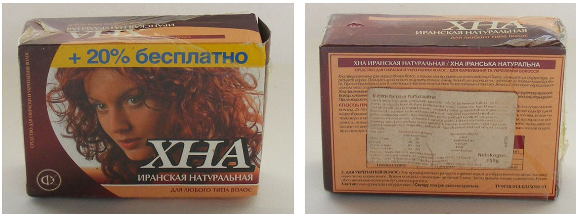
Packages of henna produced in Iran, marketed in Russia, 1990’s 28