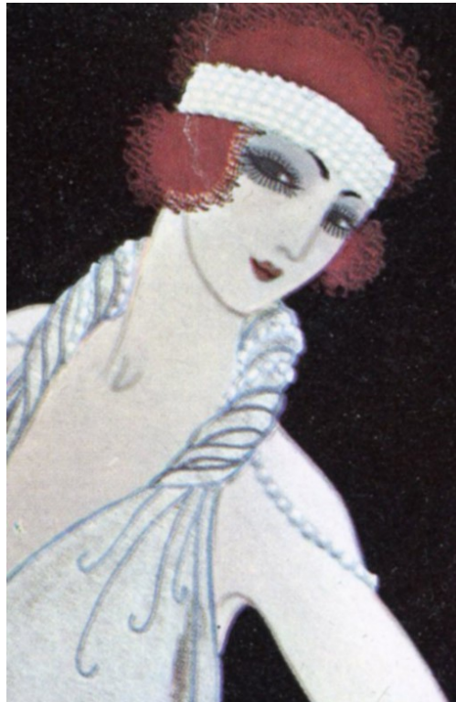
Madame William Randolph Hearst (Marion Davies) by Erté, early 1920’s, with permed, hennaed hair, detail

“This is due to the loss of that instability in the polypeptide chains of the hair keratins which is essential to the process of permanent waving. It has been shown that the chief linkages in the chains which are involved in permanent waving are the cystine and cysteine linkages. These contain practically all of the hair’s sulphur content. The metallic dyes, however, react with the sulphur of these linkages to produce sulphides and metallic sulphide complexes. And in proportion as the cystine and cysteine are decomposed by the metallic salts, so does the hair lose its ability to be permanently waved.” 18