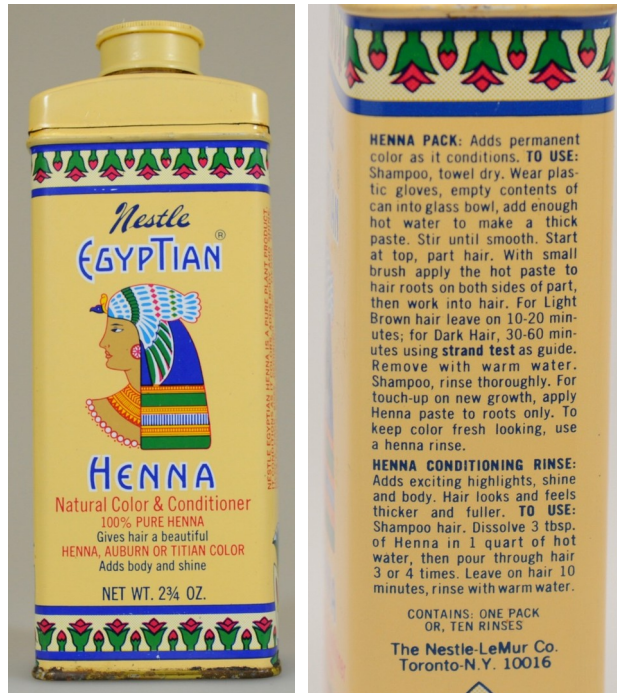
Nestle® Egyptian Henna, metal container front and side, 1970’s, author’s collection

The Nestle-Le Mur Company did manufacture a henna product that seems to have been largely henna, based on residue in original packages.