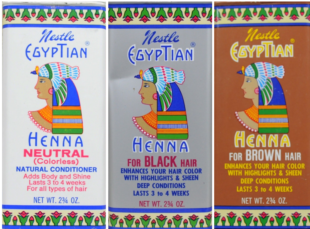
Nestle® Egyptian Henna, neutral, for black hair, and for brown hair, marketed by Nestle-LeMur in the 1970's

Whether or not the intention of this labeling of these products was meant to be deceptive, it had the effect of contributing to the misinformation about henna.