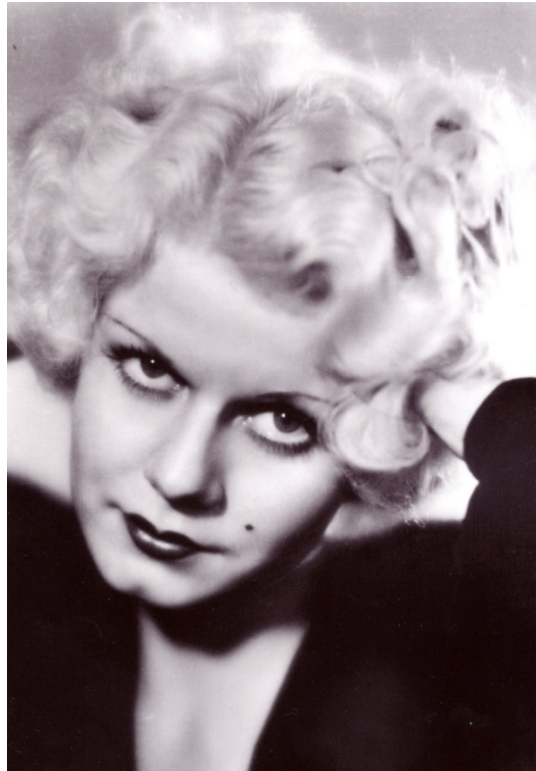
Right: Jean Harlow (born Harlean Harlow Carpenter; March 3, 1911 – June 7, 1937) protegee of Howard Hughes.