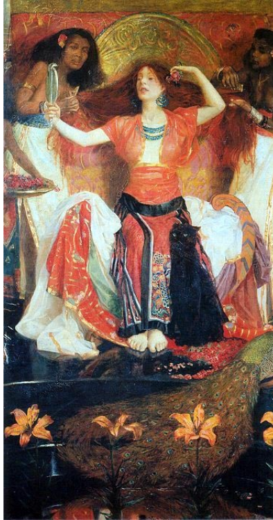
19th-century painting of Jezebel by John Liston Byam Shaw, imagining the queen as a woman with hennaed hair 46

Jezebel was identified in the Hebrew Book of Kings, 1, 16: 31 as a 9 th century princess, daughter of the king of Sidon, an elite of the indigenous people of what is currently Lebanon, and culturally linked to the Minoan, Phoenician, and Ugaritic civilizations. She was a powerful woman who held religious and secular power and property. Her name, Jezebel, meant, "Where is the Prince?" a ritual cry of grief in the religion of Baal and Anath as the bull god (the god of rain) died at the onset of the dry season in the region. The story of Jezebel, written 400 years after her death, legitimizes the murder of a queen. The story may reflect more of the Hebrew distrust of a powerful woman who adheres to a different culture and faith than it reflects of the woman herself.