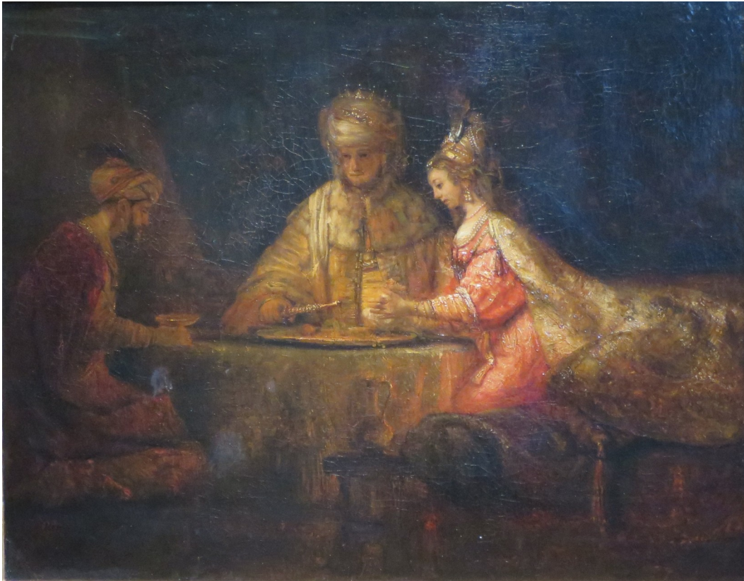
“Ahasuerus and Haman at the Feast of Esther” by Rembrandt (1606–1669) Date 1660

Amsterdam's Jewish community, but henna was not part of their experience. Other northern European artists who painted Esther were also unfamiliar with henna.