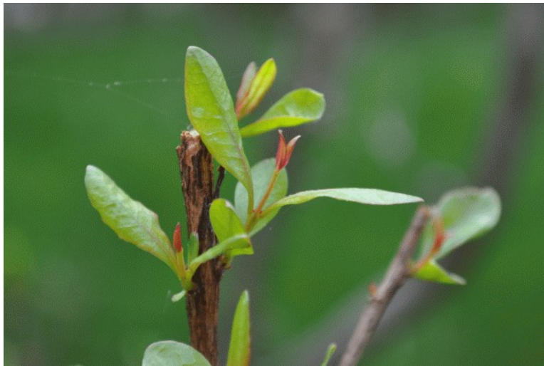
Henna, lawsonia inermis

Henna is the most plausible material referred to in these verses. Henna was used to dye women's hands and feet was available in the southern Levant. Henna was part of the culture and the cycle of religious celebration. Facial tattooing among women existed as a family and tribal marker in that area, and continued among Bedouin women until the modern era. The women had body markings consistent with what we know of Canaanite women during the period of Hebrew migration into the area; they were desired by but forbidden to the Hebrew men. It is possible that this story narrates an ongoing cultural conflict between the groups if not an actual event. This 'differencing' between Hebrews who had unmarked bodies and indigenous women who wore henna and tattoos conflict may be the source of the requirement in Deuteronomy to scrub, pare, and shave a woman's henna if she was taken as wives from the spoils of war. There was tension between the Hebrew people and the indigenous people of the land they wished to occupy. A flashpoint of that tension seems to have been the expression of a polytheistic religion through henna, which they rejected, and hennaed women with whom they wished to fraternize.