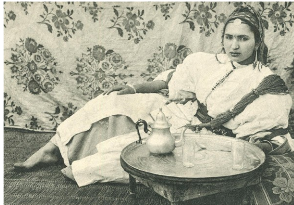
North African Jewish woman with hennaed feet, early 20 th century 51

During the centuries of Babylonian captivity, the Jewish attitude towards henna seems to have gradually evolved from absolute rejection, to grudging acknowledgment, to fond remembrance of the plant and its flowers, to eventual embrace through celebrating the adornment of Queen Esther with henna for Purim and wedding celebrations.