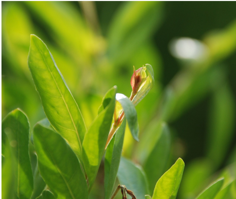
Henna, lawsonia inermis

Though this might appear to be a random list of herbs, there are many of the same ingredients mentioned here that are incorporated in Royal Unguent 55 as described by Pliny. This may be a bridegroom singing a song about preparing henna, incense, a wedding dinner, with pomegranates being a symbol of fertility.