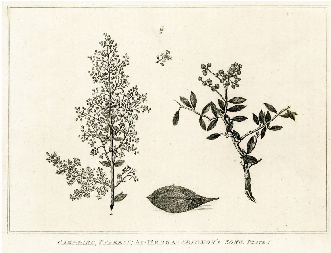
Image of henna from a mid-19 th century edition of the Holy Bible, mid-19 th century, illustrating the mention of henna (Camphire) in the Song of Solomon

Henna, Lawsonia inermis , referred to as 'Camphire', is mentioned in the Song of Solomon, "My Beloved is unto me as a cluster of Camphire in the vineyards of En-Gedi" Song of Solomon, I, 14, as well as in the Talmud.