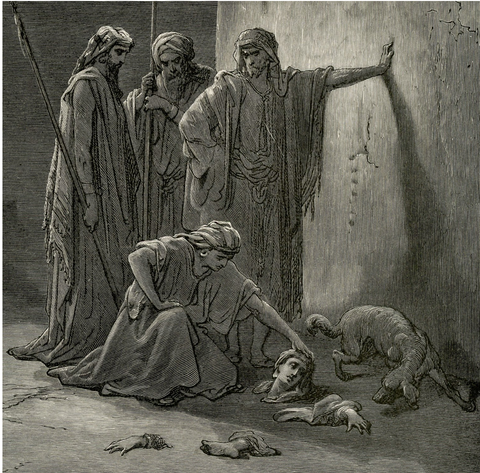
Jehu's companions finding the remains of Jezebel, 1870, Gustave Dore

possibly to negotiate a political marriage with the conquering leader. Jehu ordered her retinue to throw her from the upstairs window where she waited to consummate a political settlement.