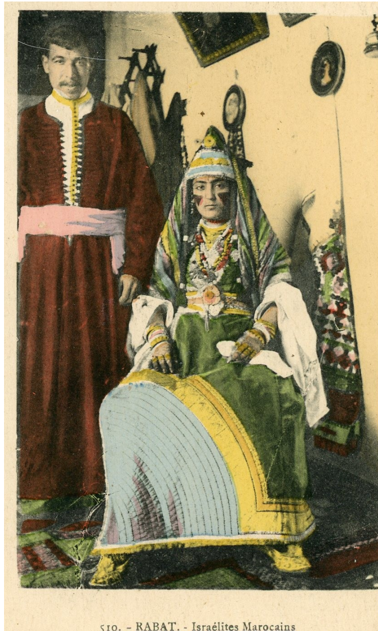
Hennaed bride from Rabat, Morocco, 1922

afterlife. 33 Henna was also part of hametz, the return to the joys of life at Pesach at end of Passover for Mimouna. 34