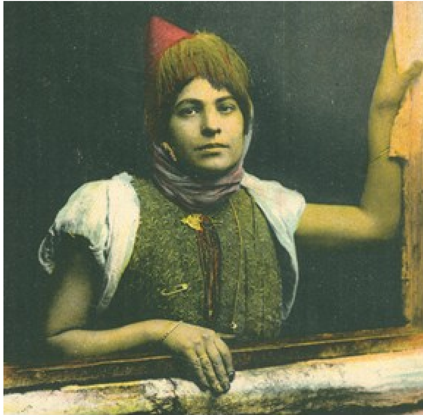
Tunisian Jewish woman with fingernails and fingers on her right hand hennaed above the knuckle, postcard from 1922

At the end of the 19 th century, henna was embraced by Sephardic and Misrahi Jews, particularly as adornment for the bride at her wedding. 28 The Yemeni Jewish bridal henna was one of the most complex henna traditions, involving several days of complex sequential henna application. 29 Jewish women across Persia, the Levant, and the Maghreb loved henna for everyday use as well as celebrations; weddings required that the bride be hennaed, with henna also for the groom and guests. 30 Kurdish Jews celebrated Purim with henna for young girls in the belief that Esther was hennaed for her meeting with King Ahasuerus. 31 A Jewish Kurdish woman was hennaed for her wedding, and her groom and all the guests at the wedding had henna as well. 32 If a person died when betrothed, that person was hennaed to meet the spouse as a newlywed in the